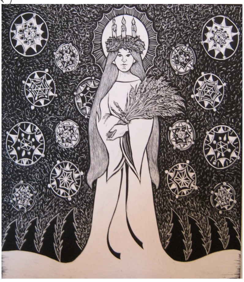
December 13th, 14th and 15th, 2013 The Shea Theater Turners Falls, Massachusetts